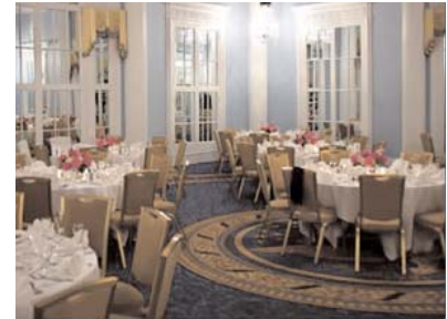
Gerald Ford Presidential Room, Amway Grand Plaza Hotel

Please join us for our third annual conference for information sessions presented by knowledgeable experts, networking opportunities and much more. Mark your calendars and hold these dates. View at www.MASFSA.org